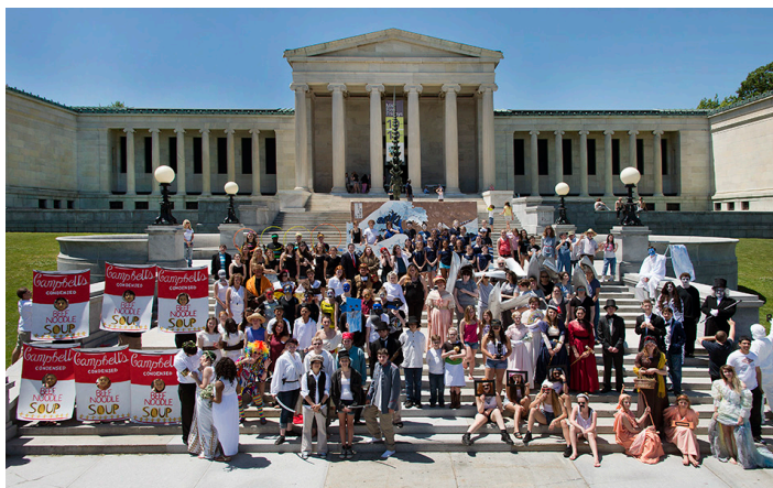
Art Alive 2014 participants gather on the Delaware Stairs.