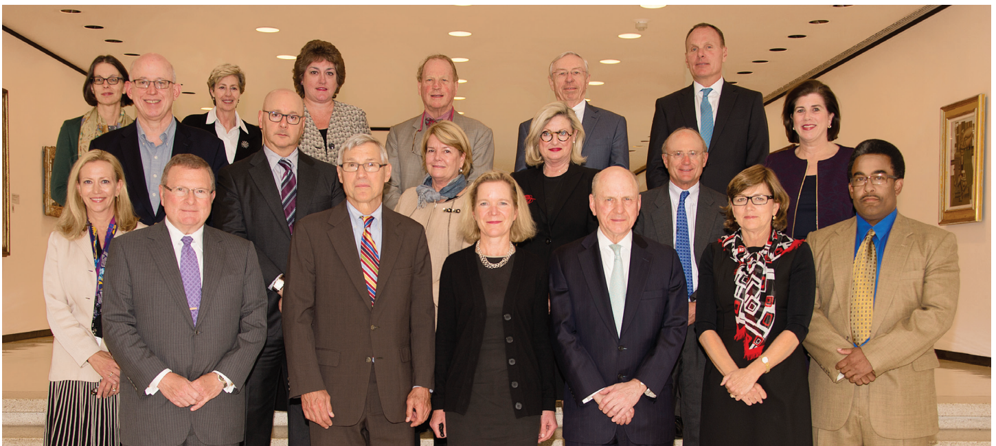
The 2013-2014 Buffalo Fine Arts Academy Board of Directors.