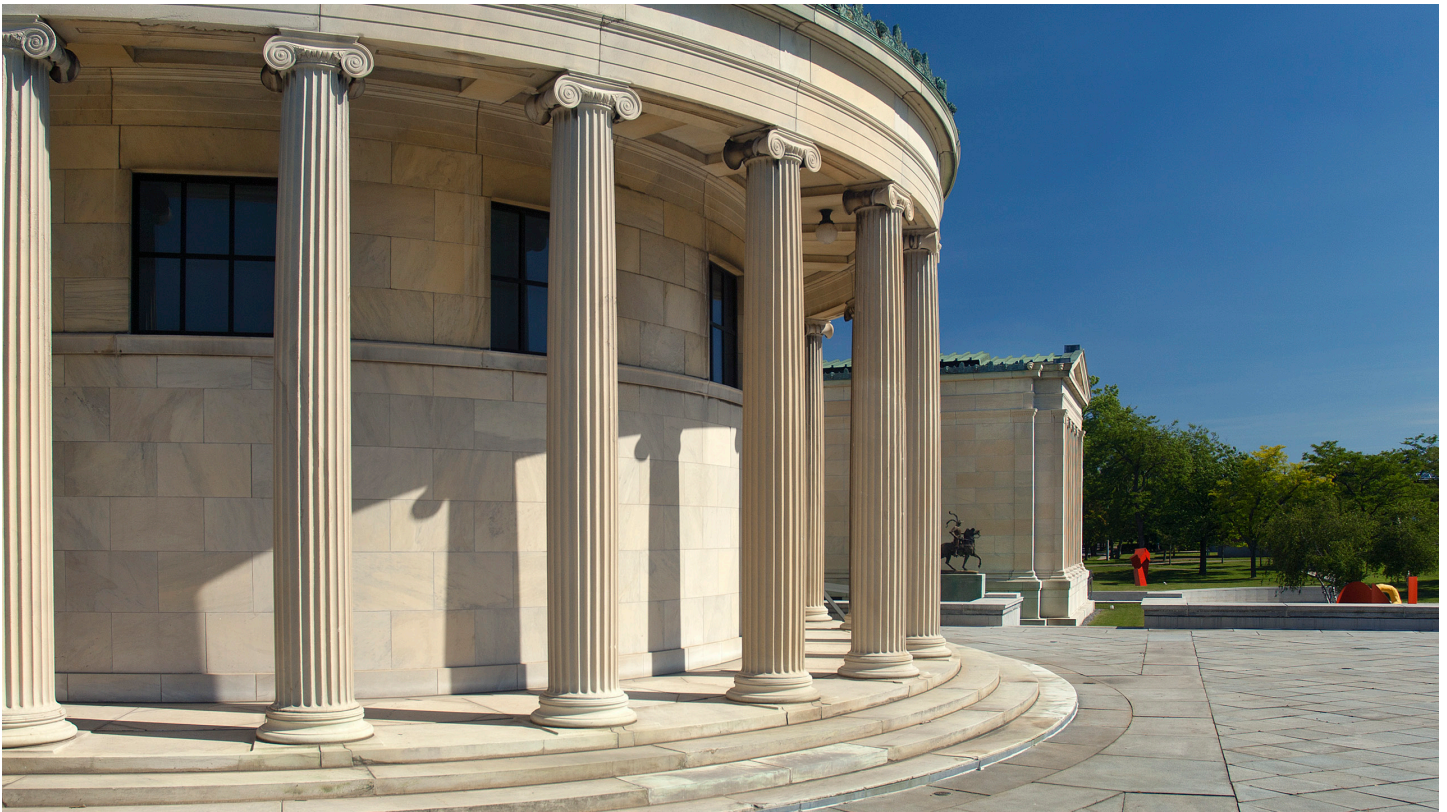
The Elmwood Avenue Portico.